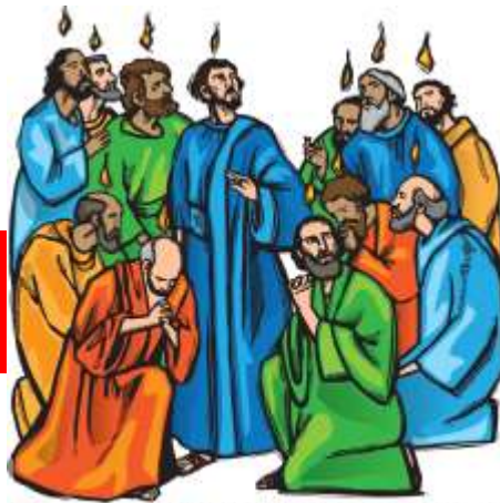
The Holy Spirit Descends on Pentecost