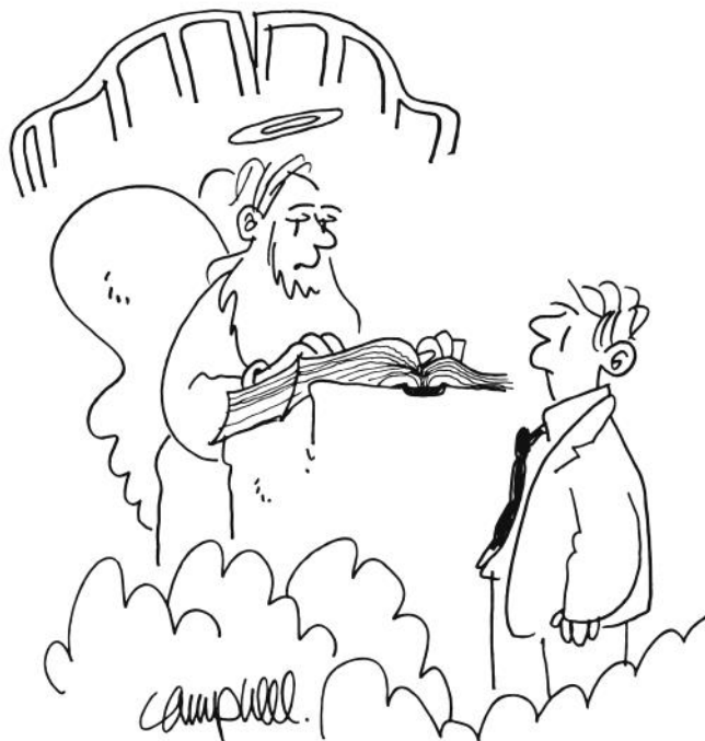
Actually, sir, the rules were chiseled in stone